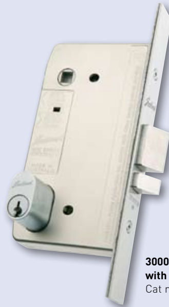
3000 Series with cylinder Cat no. 34C0