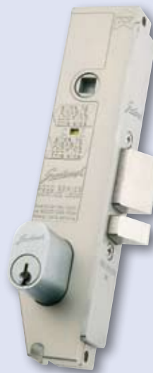
2000 Series with cylinder Cat no. 24C0