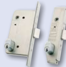
3000 & 2000 Series Note position of hub to cylinder